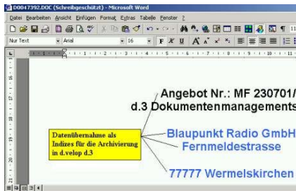
Ill. 2: Arbitrary field information can be taken over for archiving.

transfer from the d.3 system to a Word document – d.link for microsoft office offers to you this possibility.